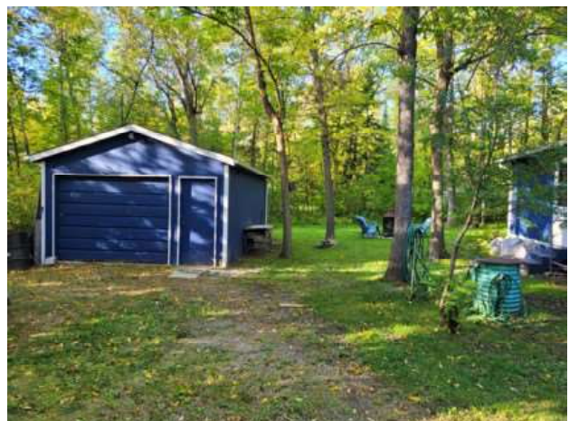
Single Detacted Garage