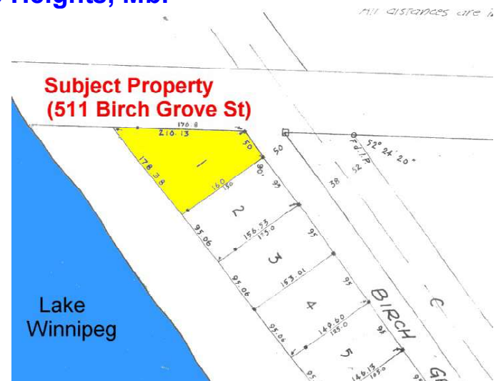
178 ft Lakefront on Lake Winnipeg