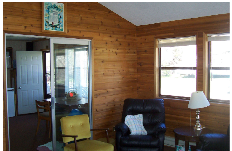
Sunroom with Vaulted Ceiling