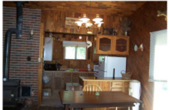
Large Open Plan Kitchen