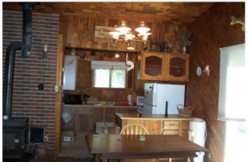
Large Open Kitchen Plan