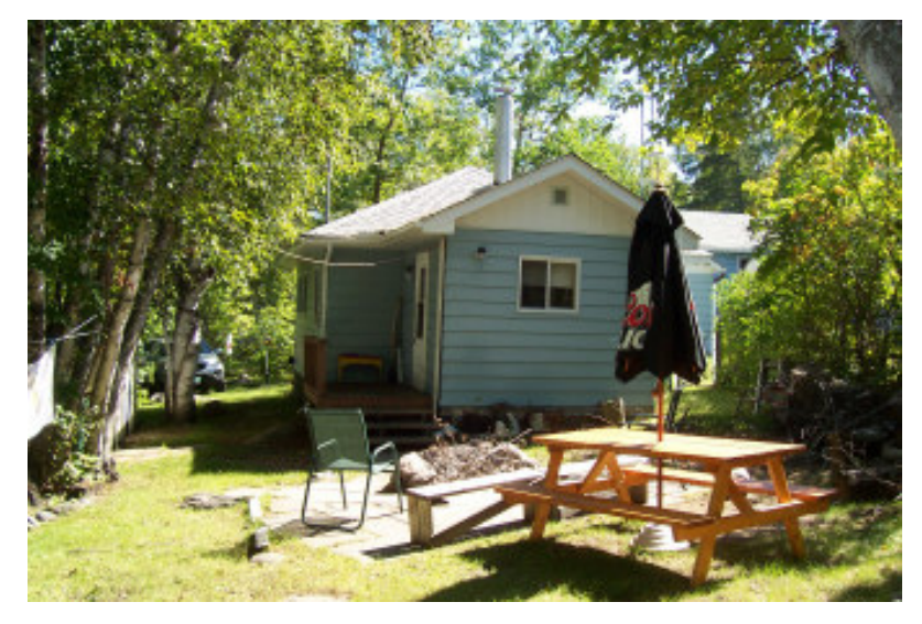
Back Yard area