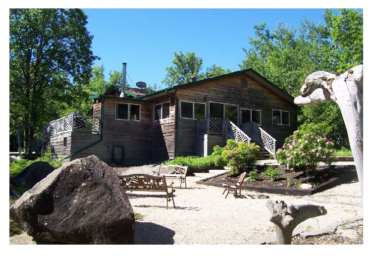
Large maintenance free yard area