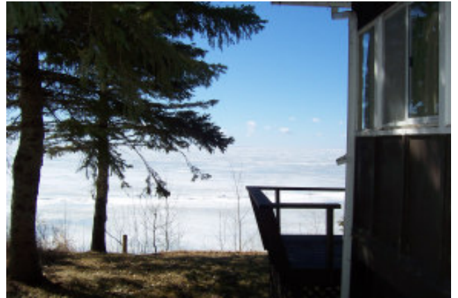
Westerly Lakeview over Lake Winnipeg