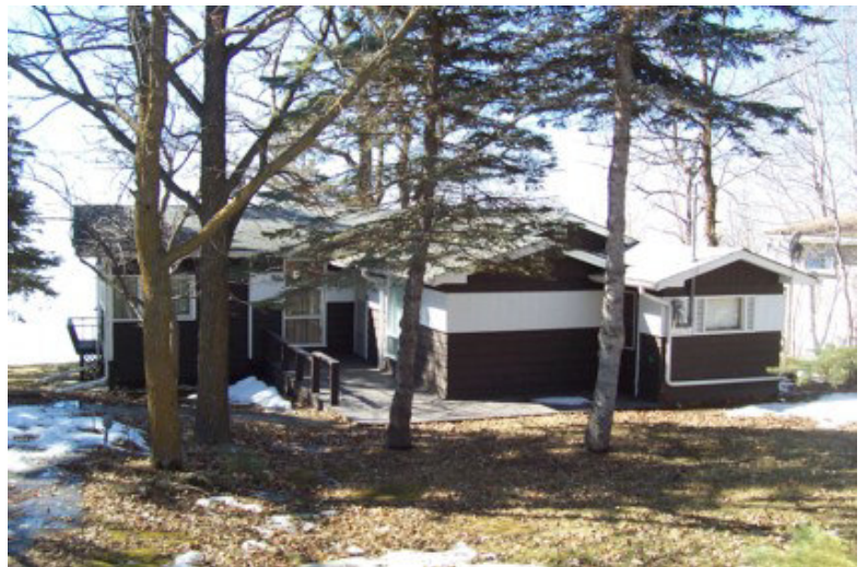
Back Photo of Cottage