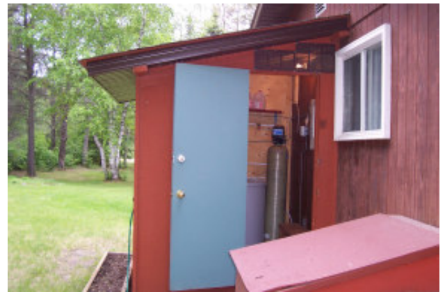
Insulated & Heated Well & Pump room