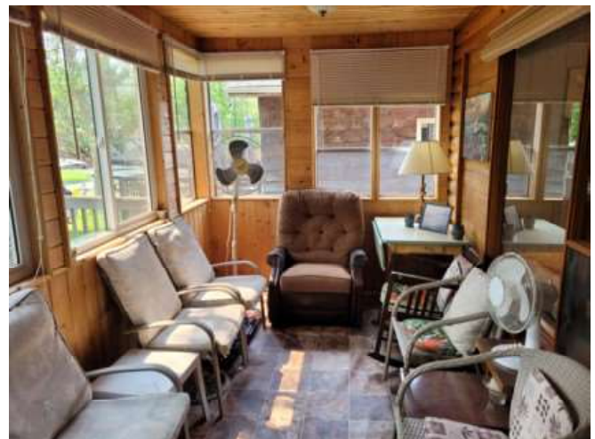
Front Veranda area